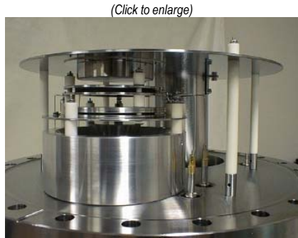
40mm Z-Gap MCP Detector Mounted on AREF (RETOF)

18mm and 25mm MCP Microchannel Plate Detectors are available on 4½ and 6 inch conflat flanges. 40mm MCP Microchannel Plate Detectors are available on a 6 inch conflat flange. Detectors are baked and shipped under vacuum.